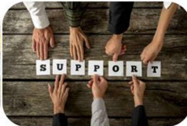
Join interesting relevant groups