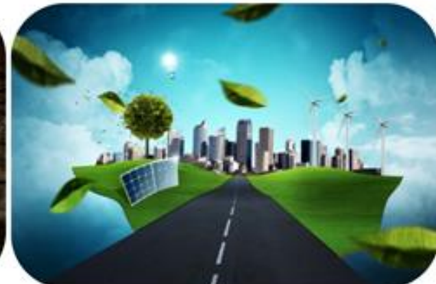
Chat, Network and Learn