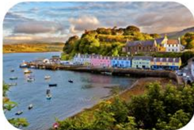
Complete your profile